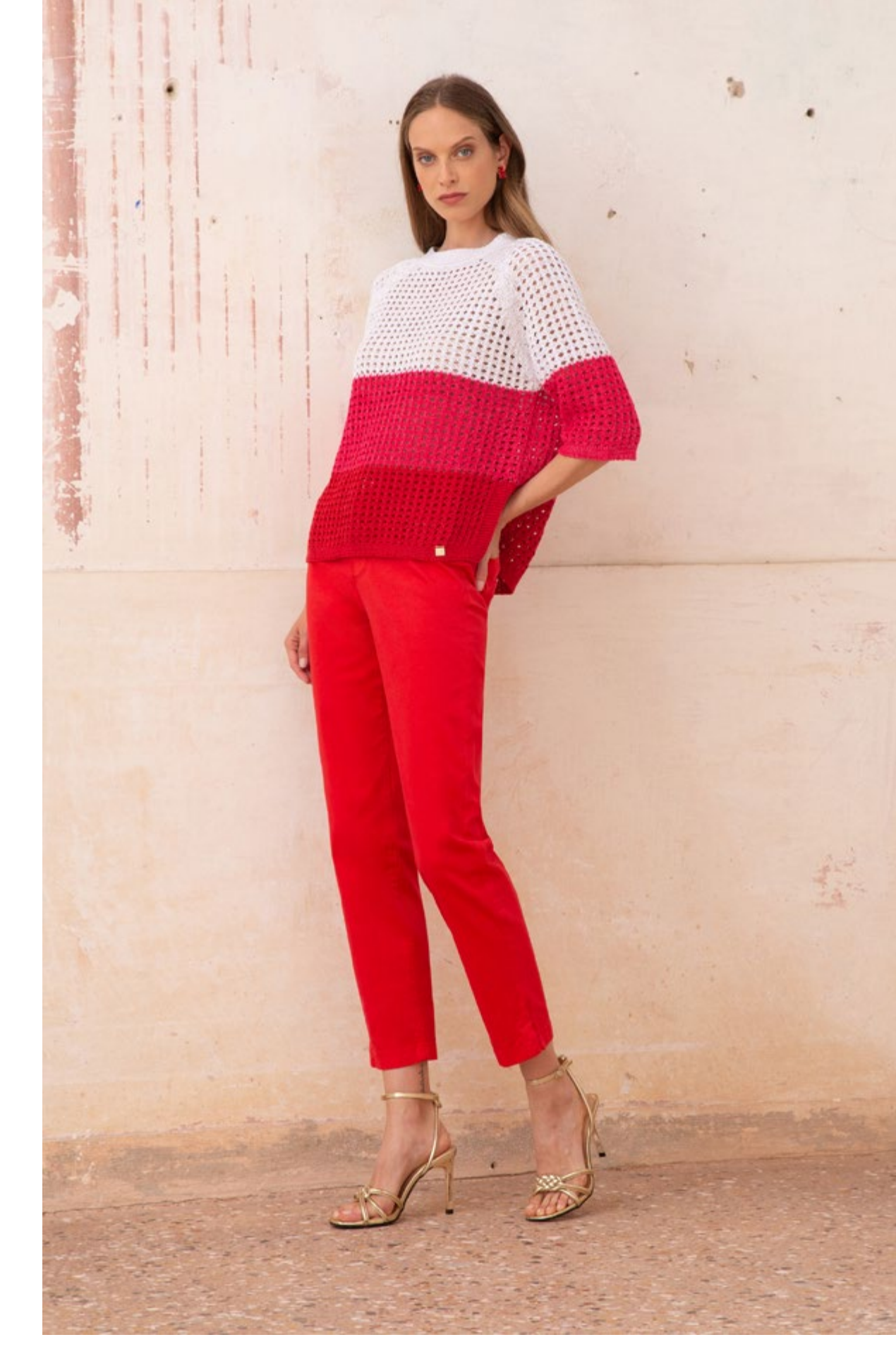
Sweather DEVIN 3313D 10074 Trousers FIRST 4761 741