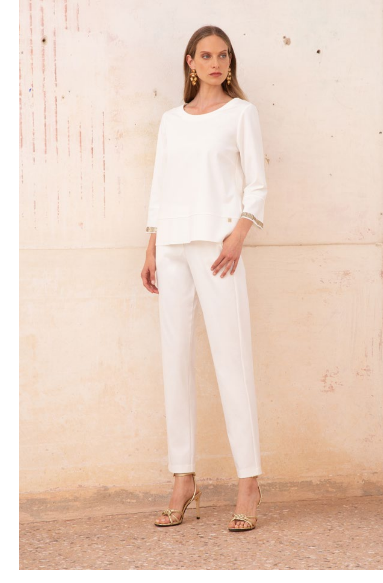
Shirt NALA-PS 2357 130 Trousers FEBE 2357 130