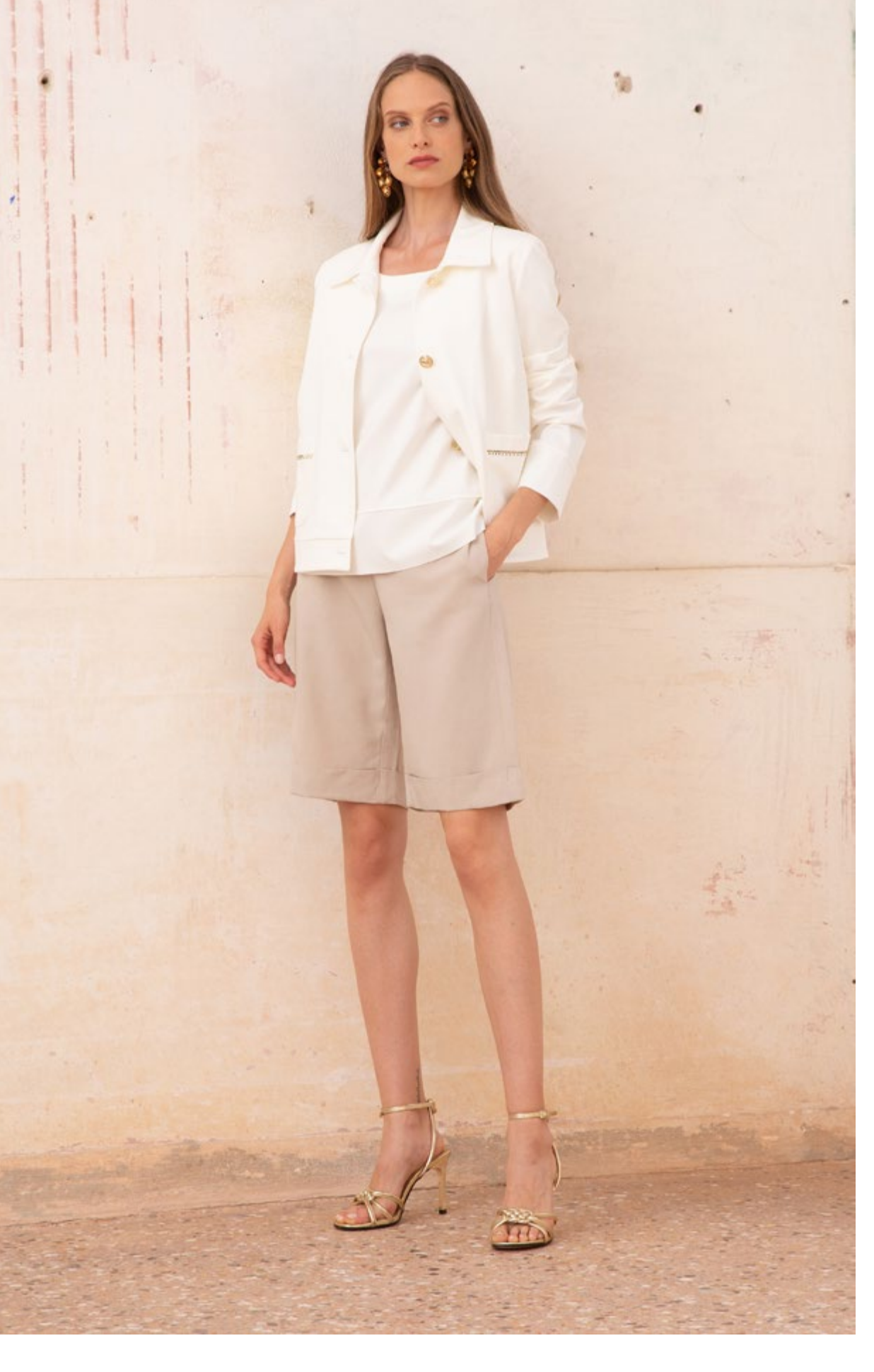
Jacket ALEXIS-S 2357 130 Shirt NALA-PS 2357 130 Bermuda FILO-PAS 5260 190