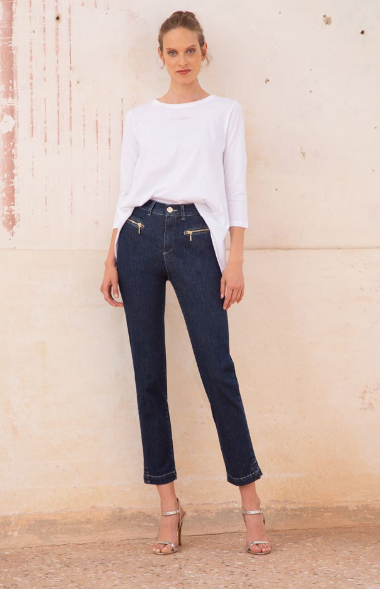
T-shirt MAUDE-D 2362 100 Trousers FIRST 4776 560