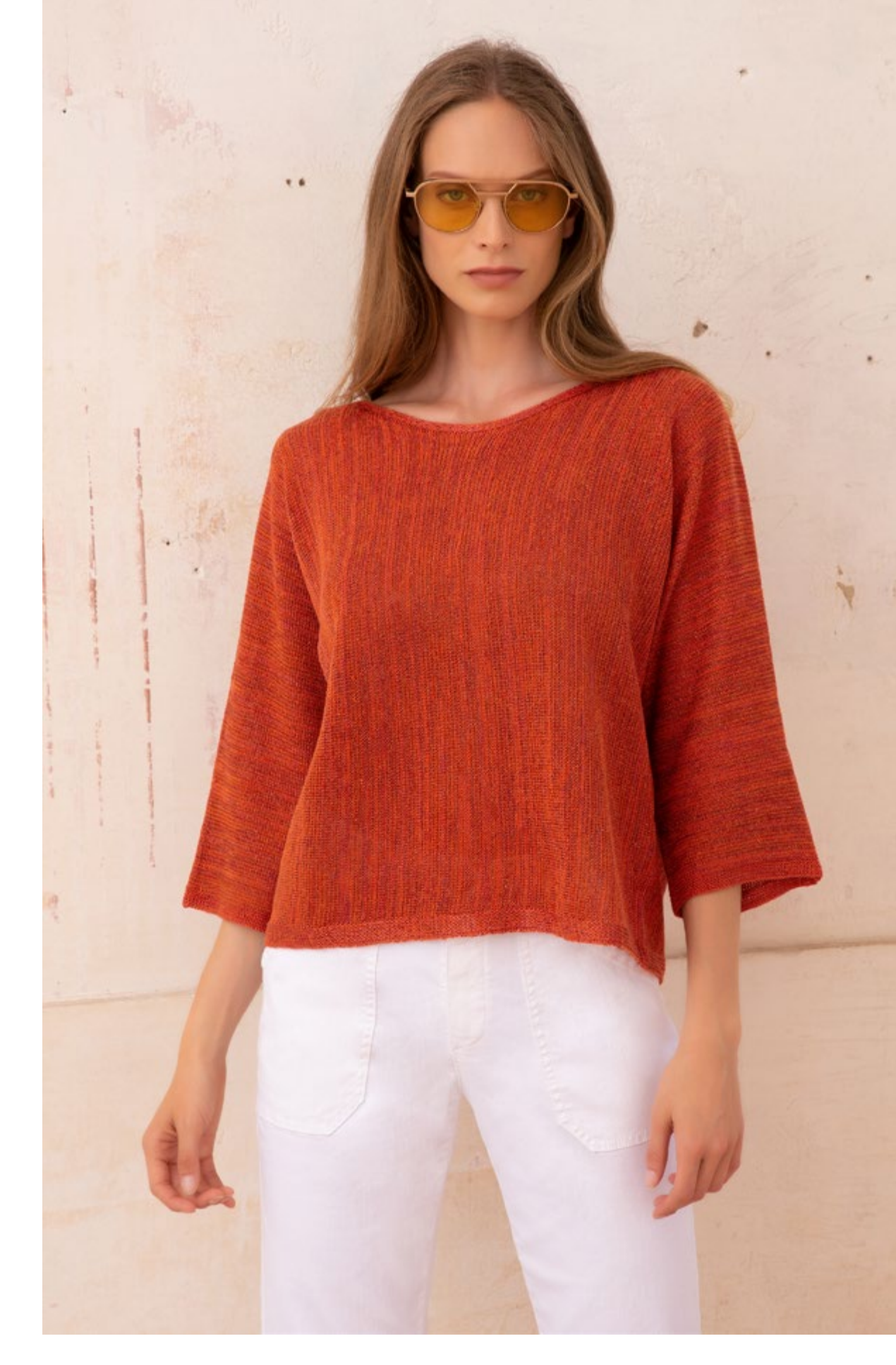
Sweather DILETTA 3318 477 Trousers FLORES 4761 100