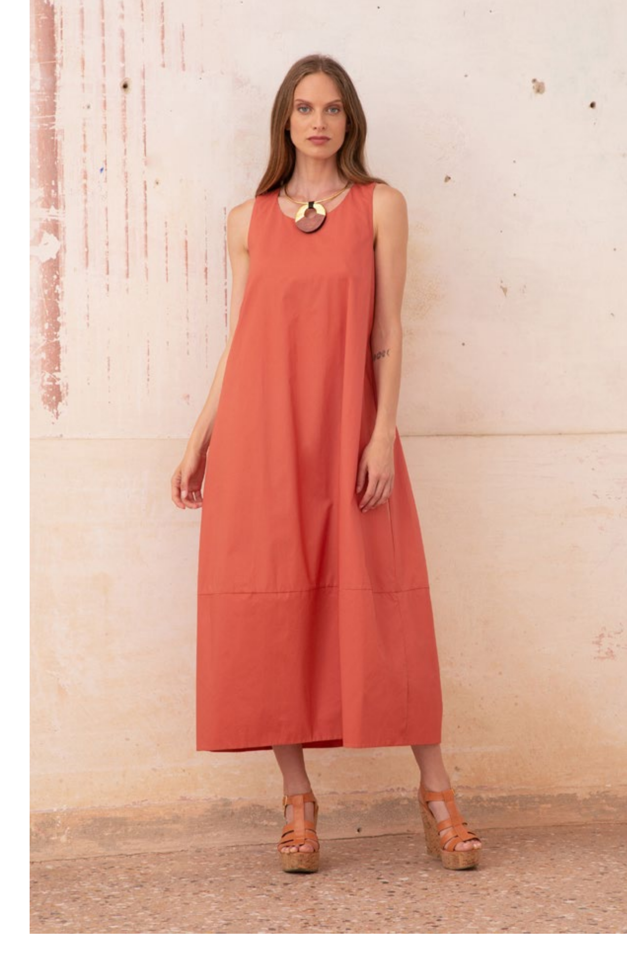
Dress RHEA 2349 477