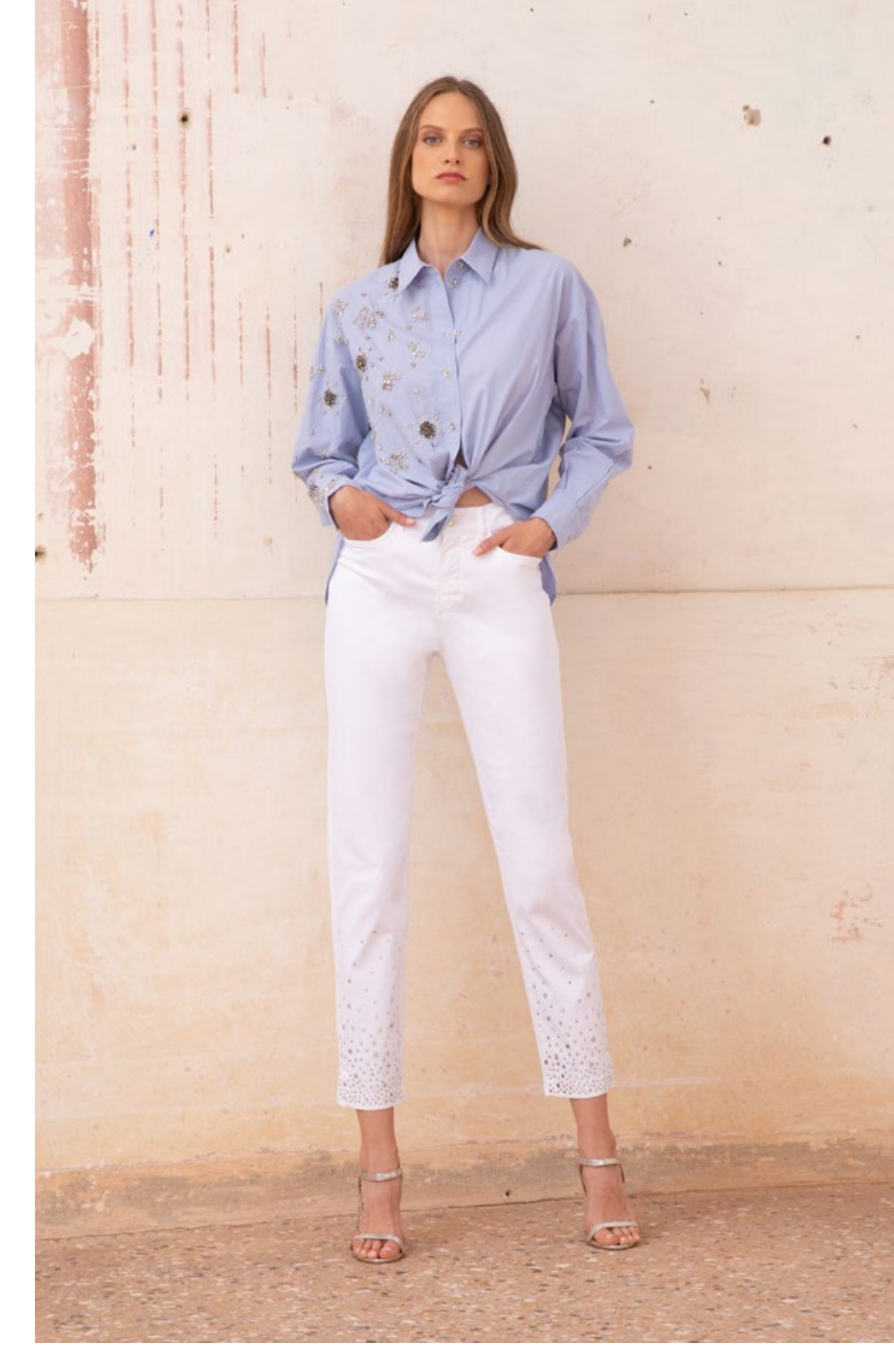
Shirt SAYLOR 5261A 302 Trousers FIVE-SSF 4761 100