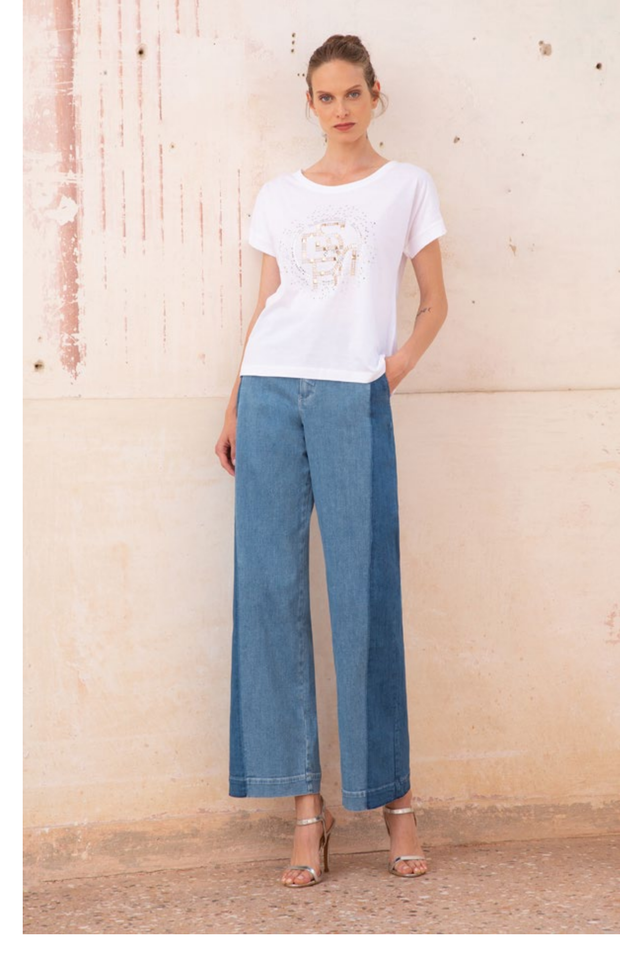
T-shirt MARTHA-DSM 2362 100 Trousers FICTION 4785B 53055