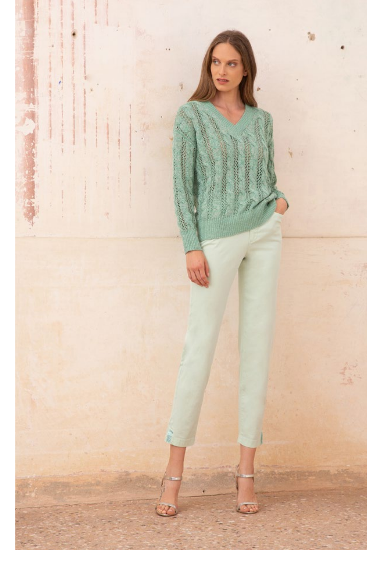
Sweather DALE 3313 803 Trousers FIVE-SPA 4761 803