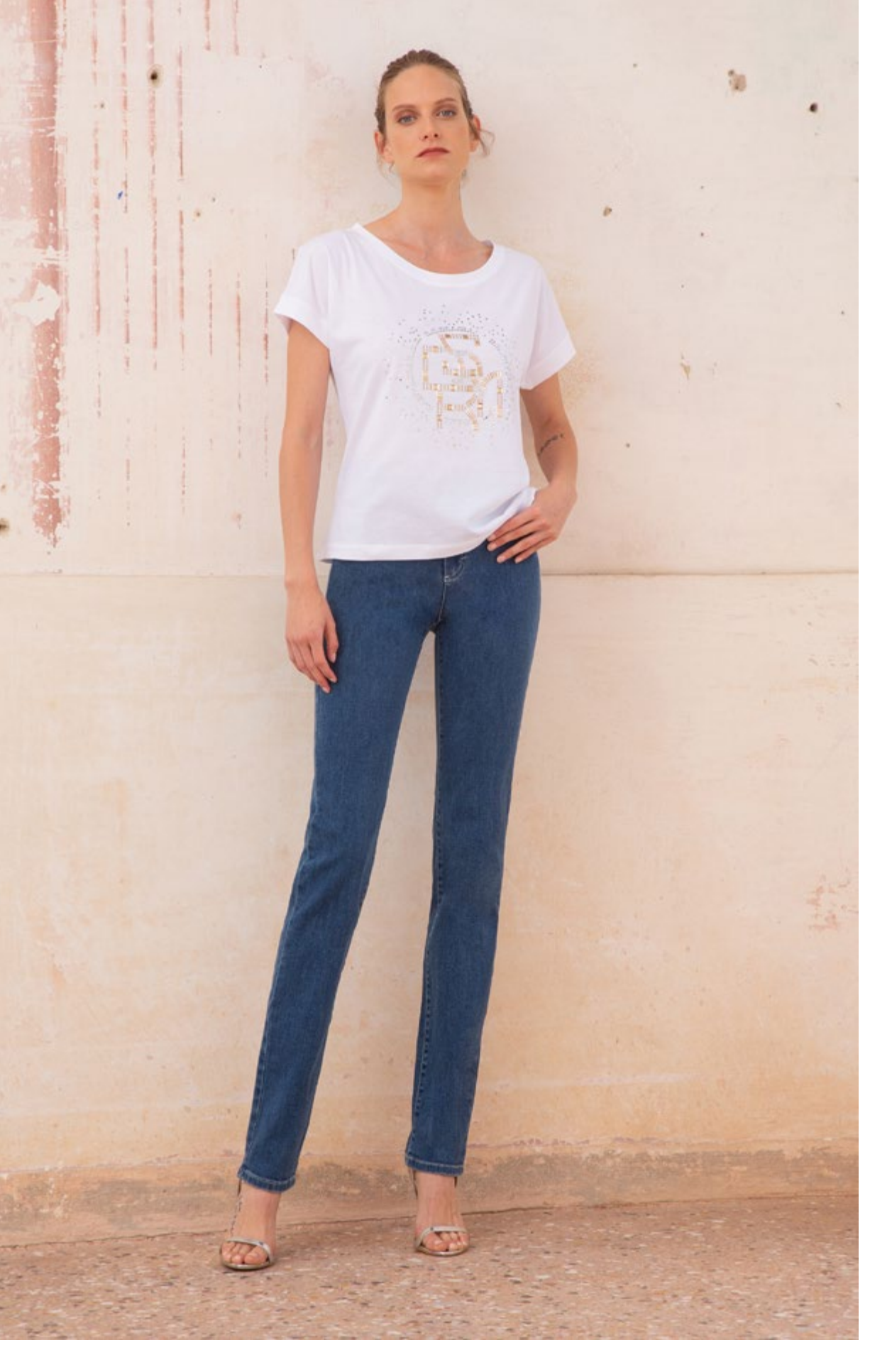
T-shirt MARTHA-DSM 2362 100 Trousers FEVER-SST 4785 550